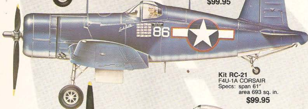
Kit RC-21 F4U-1A CORSAIR Specs: span 61" area 693 sq. in. $99.95