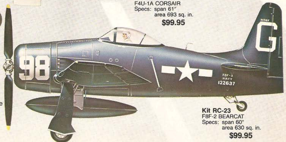
Kit RC-23 F8F-2 BEARCAT Specs: span 60" area 630 sq. in. $99.95

Top Flite offers you six of the world's most legendary fighters in the stand-off sport scale that's gaining popularity with builders all over the world. And no wonder! Thanks to Top Flite, these fighters have winning scale appearance, plus subtle modifications that give you the utmost in flying qualities as well.