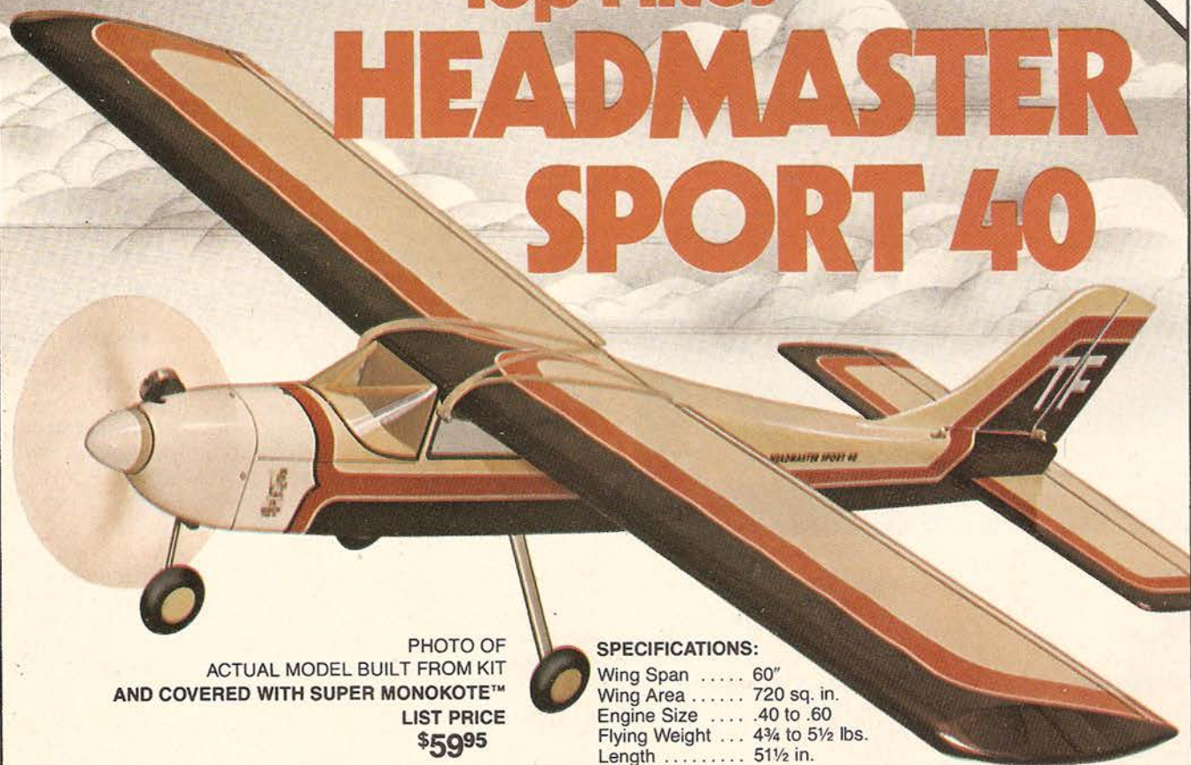
PHOTO OF ACTUAL MODEL BUILT FROM KIT AND COVERED WITH SUPER MONOKOTE™ LIST PRICE $59.95