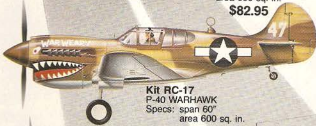
Kit RC-17 P-40 WARHAWK Specs: span 60" area 600 sq. in. $82.95