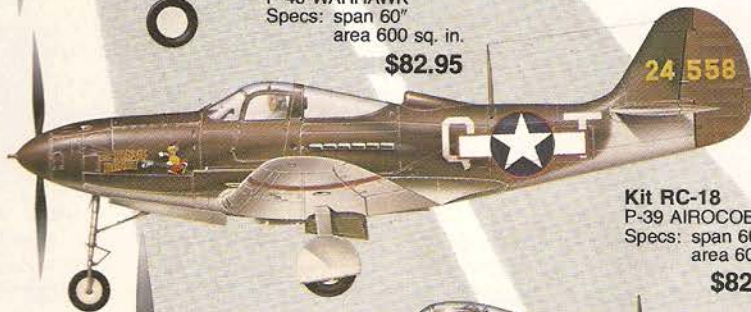
Kit RC-18 P-39 AIROCOBRA Specs: span 60" area 600 sq. in. $82.95