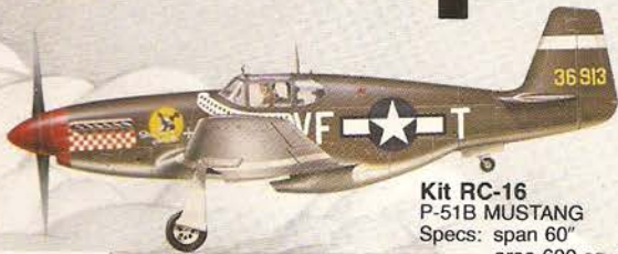
Kit RC-16 P-51B MUSTANG Specs: span 60" area 600 sq. in. $82.95