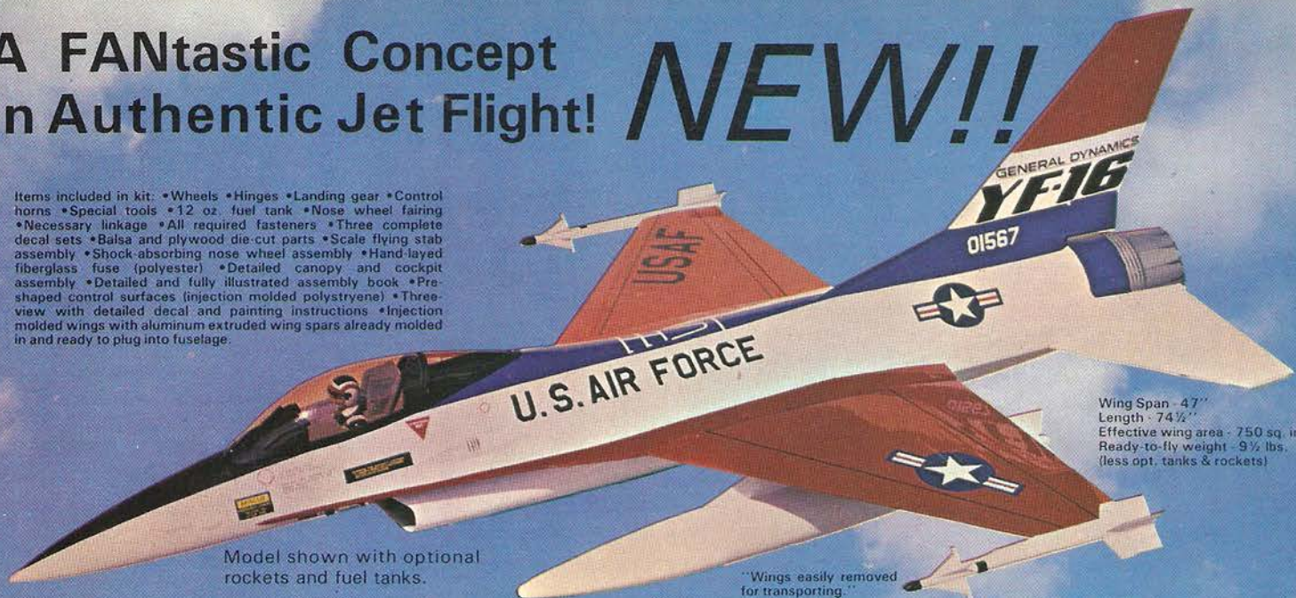
Model shown with optional rockets and fuel tanks.

Items included in kit: •Wheels •Hinges •Landing gear •Control horns •Special tools •12 oz. fuel tank •Nose wheel fairing •Necessary linkage •All required fasteners •Three complete decal sets •Balsa and plywood die-cut parts •Scale flying stab assembly •Shock-absorbing nose wheel assembly •Hand-laid fiberglass fuse (polyester) •Detailed canopy and cockpit assembly •Detailed and fully illustrated assembly book •Pre-shaped control surfaces (injection molded polystyrene) •Three-view with detailed decal and painting instructions •Injection molded wings with aluminum extruded wing spars already molded in and ready to plug into fuselage.