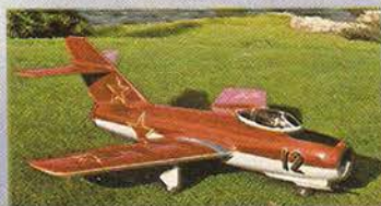
2. Russian Aerobatic Team

Kit includes any one of four decal sets! In addition to your choice of decals, you will receive a matching set of painting, E-conoting instructions, 4 view for both proof of scale and decal location and a complete materials list outlining the recommended thinners, primers and paints.