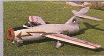
4. Czech Aerobatic Team