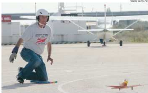
Depois do aturado trabalho de montagem, ver o modelo elevar-se no céu é a compensação suprema do aeromodelista

ideia de o aeromodelismo ser uma atividade muito cara. «Podemos construir um modelo por 40 ou 50 euros. O giro é ir reunindo materiais e construir gradualmente os nossos modelos. Chego a levar dois meses a criar um novo. E o que é mais interessante é que desenvolvemos vários conhecimentos em simultâneo. Temos de saber um pouco de tudo — de física, de química, de modelagem, aerodinâmica, tudo», explica. Entre os vários programas televisivos e radiofónicos em que participa, Isidro tem sempre tempo para