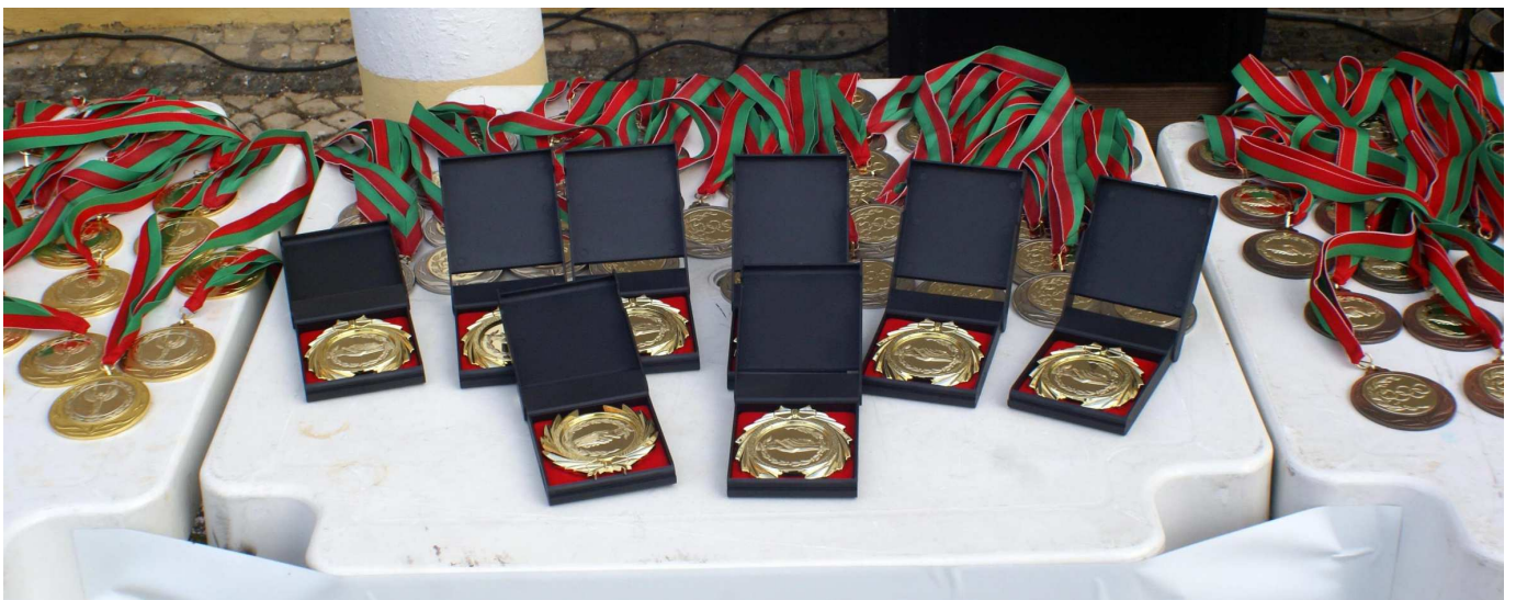
Giant R/C model and some beautiful awards.