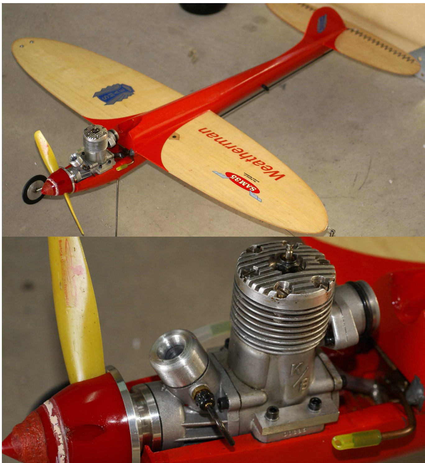
K&B powered Weatherman.